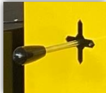
Detail of the 4 way fine control lever

Model 01B5SE_400 is the most popular model for awkward placements from the ground onto 3D machines, lathes, over perimeter protections, narrow openings, etc., thanks to its 360° pivoting and in all those applications where there is no space to move the load with a forklift or other large sizes lifting equipment.